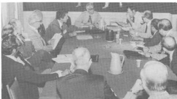
Meetings Planning Committee meeting