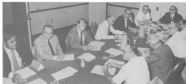
Education Committee meeting