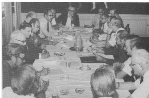
National Program and Planning Committee meeting