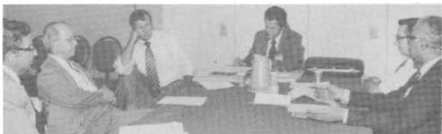
Membership Committee meeting