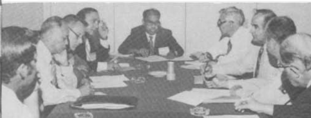
Local Sections Committee meeting