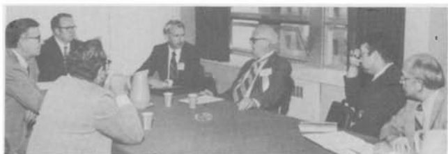
Seed and Meal Analysis Committee meeting