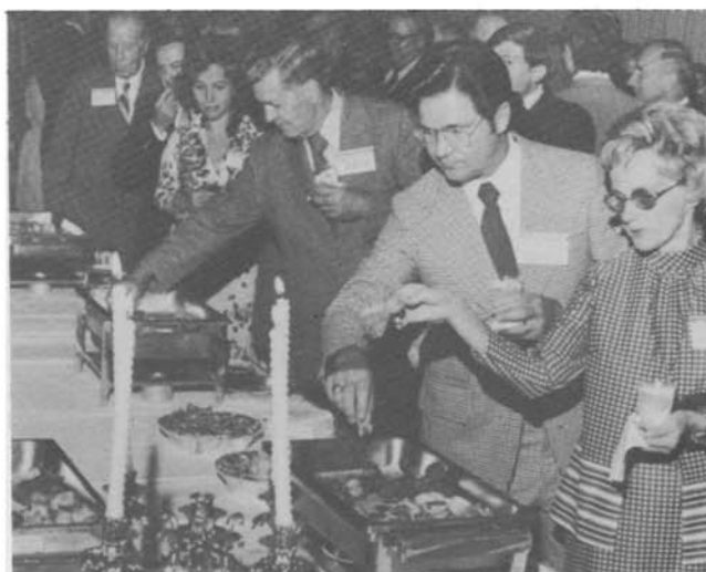
Buffet table at mixer