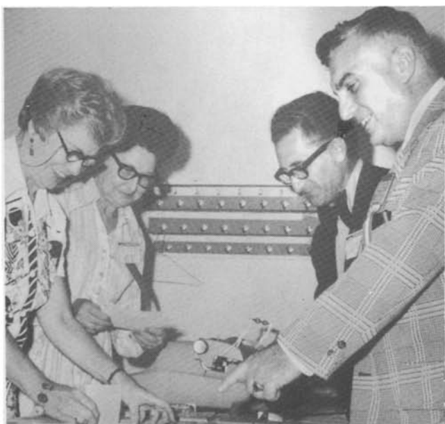
Checking final count of registration